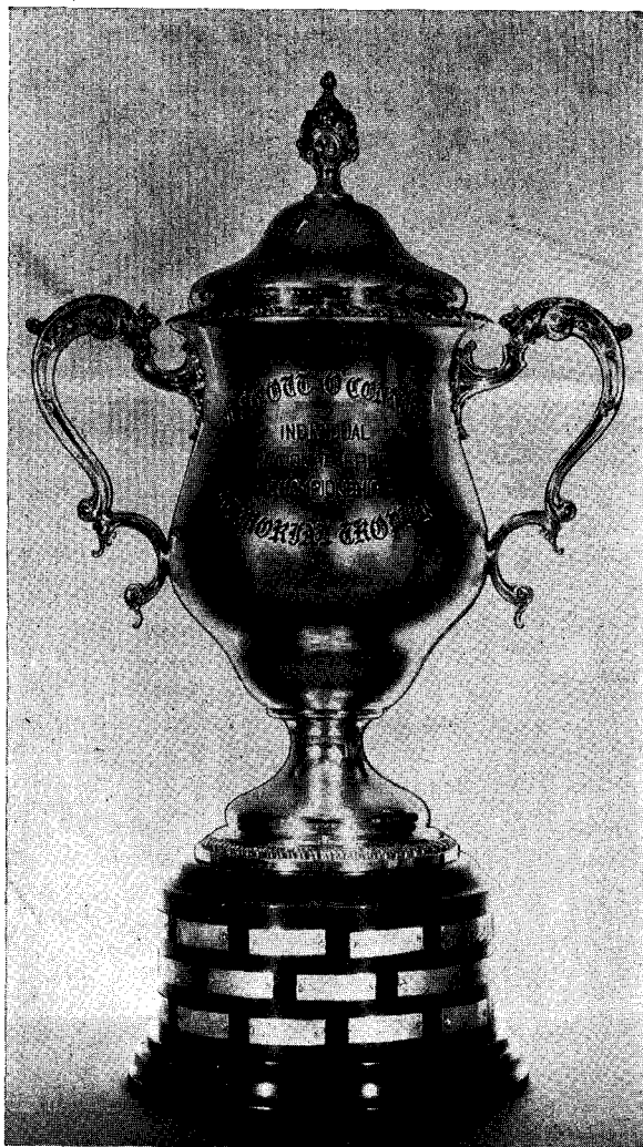
ONE OF TWO NEW AND IDENTICAL CHAMPIONSHIP TROPHIES